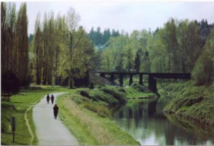
Burke-Gilman Trail, Washington — This 27-mile rail-trail, railbanked in November 1998, traces the waterways along Seattle's northern half, linking industrial centers, the University of Washington, and residential communities with outerlying parks and farmland along the Sammamish River.

Atlanta, for example, is creating a network of commuter and recreation paths that will connect trails with transit stations, light rail, bus lines, colleges and tourist attractions to help ease the city's notorious traffic. Its newest development is the 22-mile Beltline, which will turn old rail lines