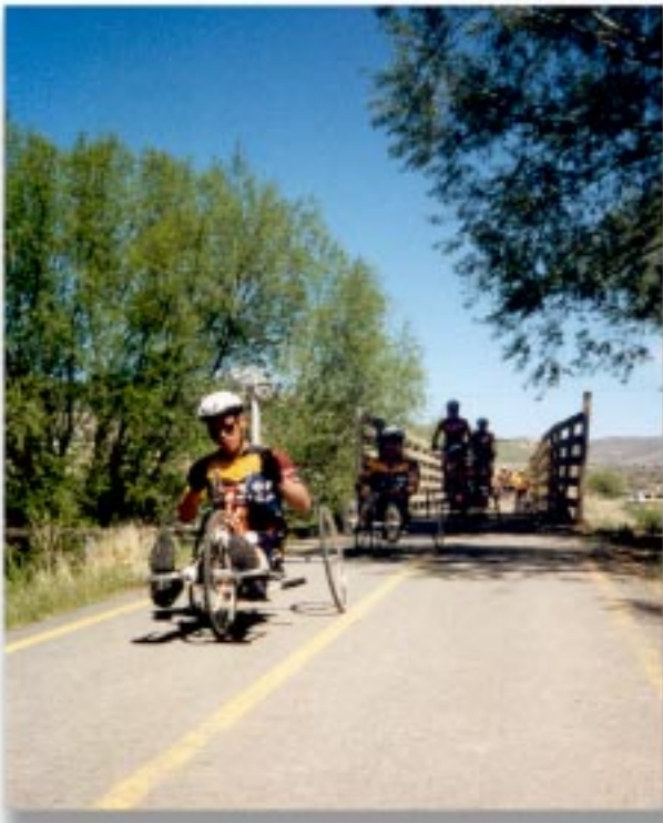
Historic Union Pacific Rail Trail, Utah — Railbanked in May 1998, this 28-mile trail is today a high-altitude adventure, drawing mountain bikers, equestrians, runners and cross-country skiers from in and around Park City.

The railroads still needed a way to be relieved of the burden of maintaining unprofitable and unused lines, and the idea of transferring financial and legal responsibility of these lines to third parties, including trails, was again considered. But interested communities and potential trail managers who wanted to purchase unused railroad corridors for conversion into trails faced major obstacles under the existing system. The biggest challenge came from nearby landowners, who wrongly concluded that when a railroad stopped running trains across tracks and secured permission to abandon its common carrier obligations to provide service on the line, it also