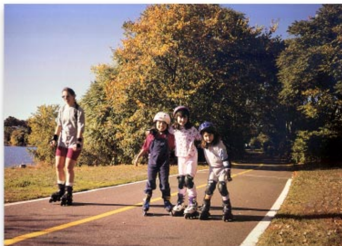
Minuteman Bikeway, Massachusetts — This popular 10.5-mile rail-trail was railbanked in July 1992 and opened in September 1996. Following the path of Paul Revere's historic ride through suburban Boston communities, the Minuteman is one of the country's most heavily used trails, providing safe passage for recreational users and bicycle commuters.

Railbanking prevents a line from being deemed abandoned when a qualified agency or group agrees to maintain the corridor as a transportation route for pedestrians and cyclists, and to preserve its integrity as a transportation route should another carrier decide to resume service on that line. Fewer than 20 percent of the country's