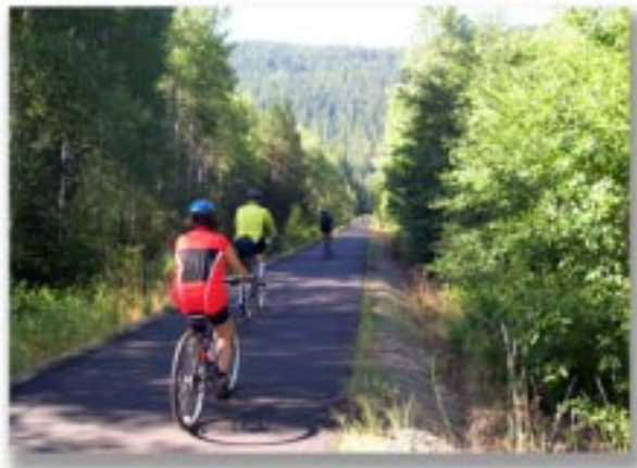
Trail of the Coeur d'Alenes, Idaho — Running 74 miles through Idaho's Silver Valley, the trail stretches west from the Montana border and extends, for 15 miles, through the Coeur d'Alene Reservation. After being railbanked in 2001, the U.S. Court of Appeals for the D.C. Circuit rejected a challenge to the railbanking order.

There are now a number of "takings" cases pending in courts around the country and in the U.S. Court of Federal Claims. Many of the cases filed in the federal district courts on behalf of persons asserting compensation claims for less than $10,000 have been certified as class actions, on behalf of all persons claiming a compensable interest in the railbanked corridor. One case has been certified as a state-wide class action. Thus far, 12 cases have been fully resolved either through settlement or the entry of final judgment by the courts. The United States has paid out approximately $3 million in these takings cases, most of which represents payments for attorney's fees and costs rather than just compensation.