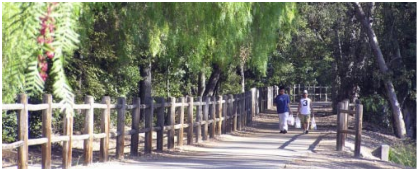
Ojai Valley Trail, California — A 5-mile extension to this charming 10-mile trail was railbanked in June 1996. Parallel asphalt and dirt tracks accommodate walkers, bicyclists, inline skaters and equestrians.

Rail-trails enhance the quality of life in the communities in which they are located, in addition to offering transportation alternatives and new business opportunities. Above all, rail-trails help preserve America’s railroad history and, when railbanking is used, preserve this valuable resource for our nation’s future rail and transportation needs.